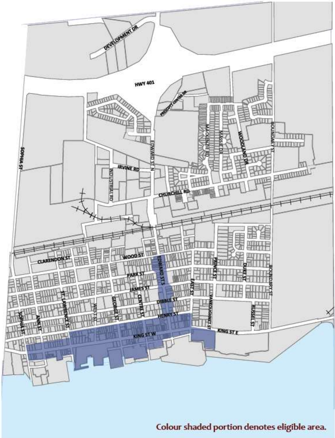
Colour shaded portion denotes eligible area.